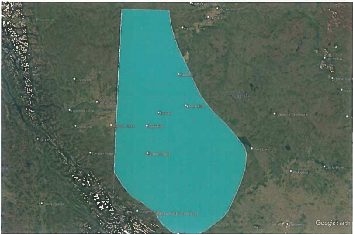
Figure 5: Wilrich Formation in Alberta