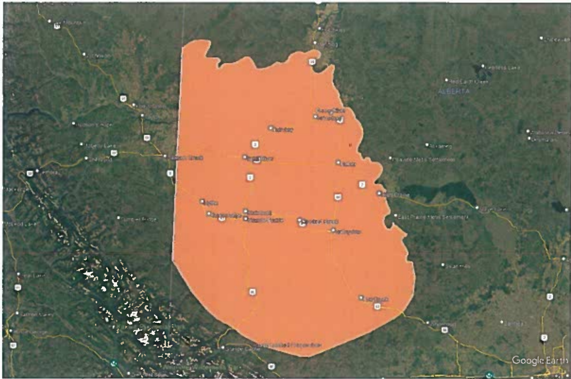
Figure 4: North Nordegg Member in Alberta