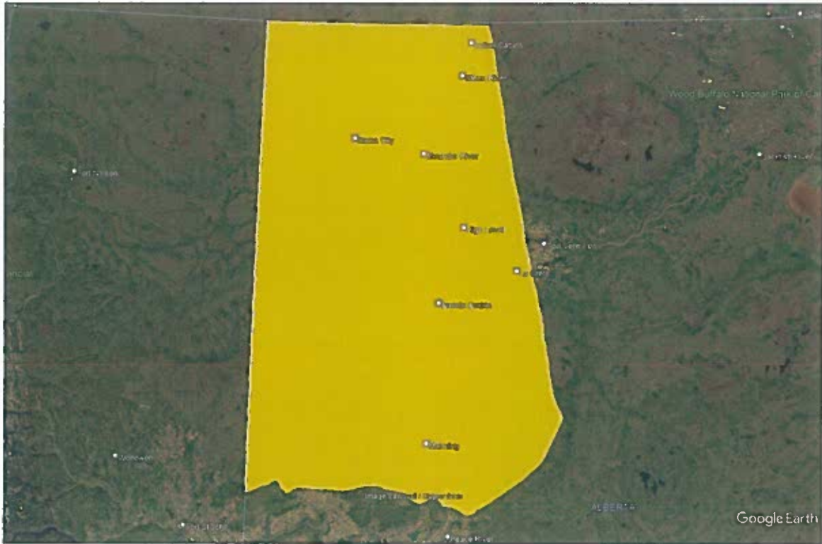
Figure 6: Muskwa Formation in Alberta

For many years, DFN has identified and tried hard to escalate concerns around the cumulative impacts of development in its traditional territory. 6 DFN's members have witnessed significant industrial and other development in their territory, which has led to serious cumulative impacts on our ability to exercise our Treaty rights and maintain our culture and way of life. Among other things, our elders, knowledge holders, land users and community members are reporting the following: