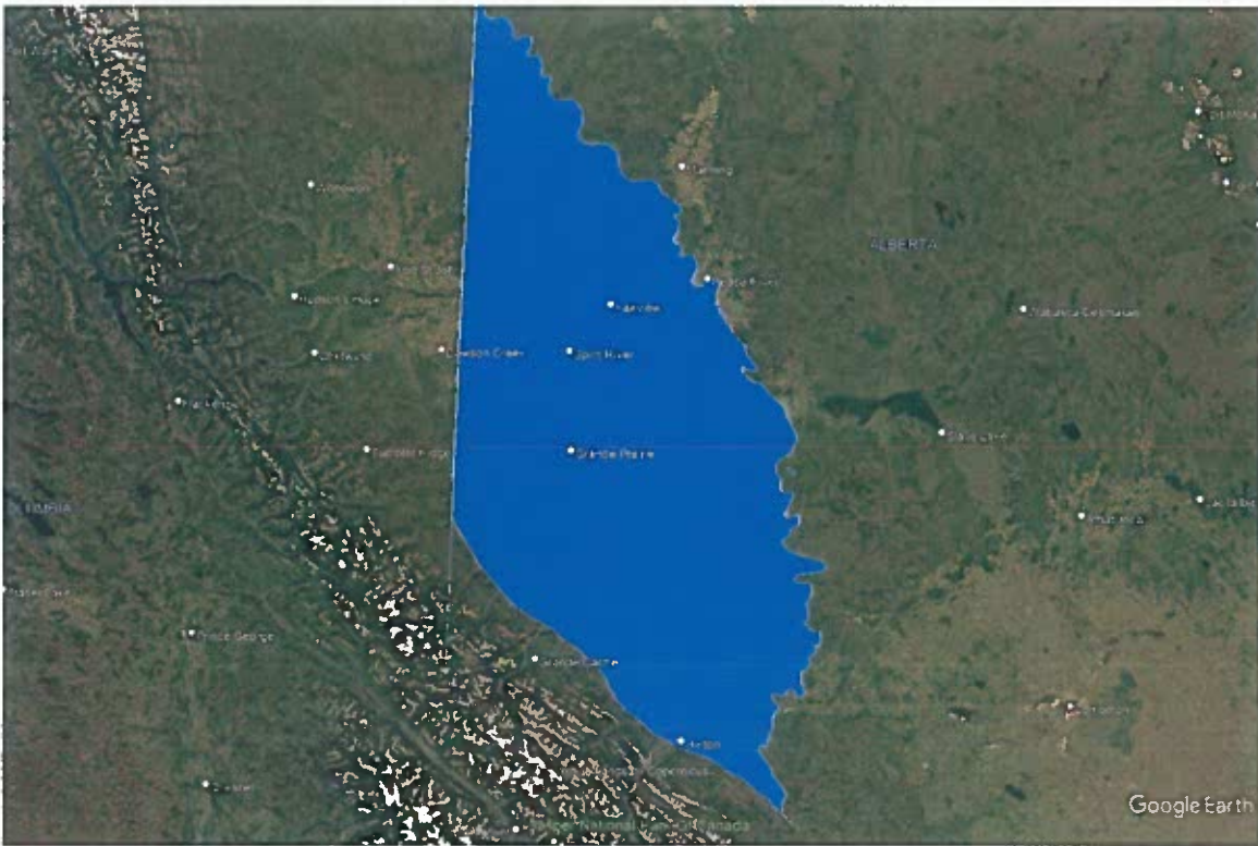
Figure 3: Montney Formation in Alberta

(“LNG”) pipeline projects meant to move LNG west to the coast and south for export into the United States. The pace of development is only set to increase in future years.